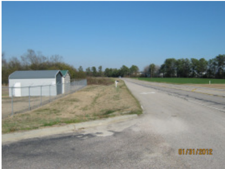
Road View 1