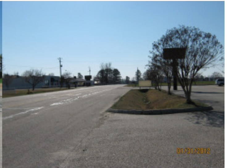
Road View 2