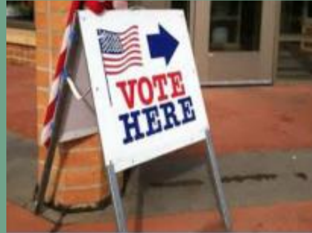
Polling Place Finder

https://gis.harnett.org/ElectionPollingPlace/