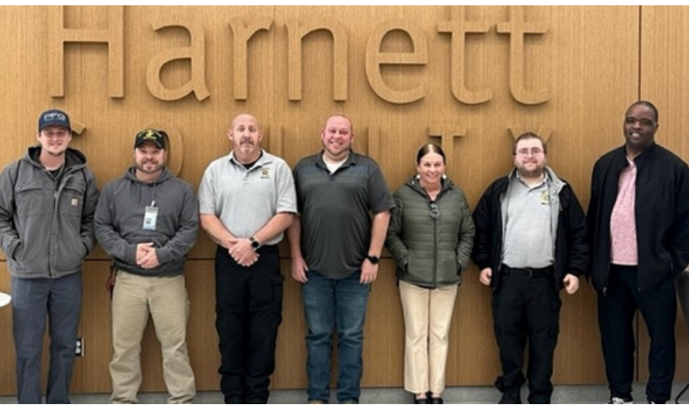
February 6, 2023 New Hire Orientation Class