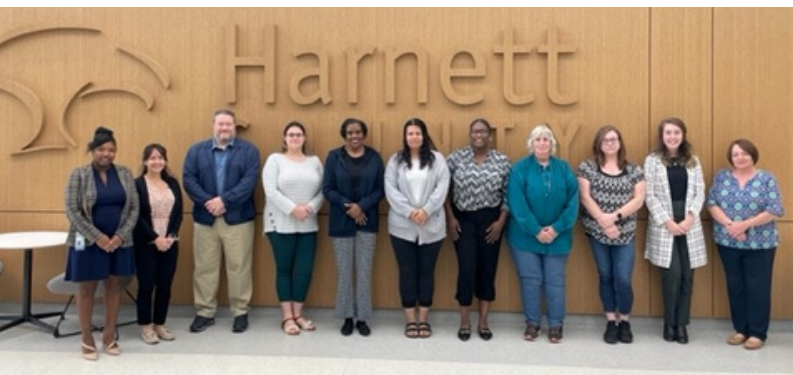
March 6, 2023 New Hire Orientation Class