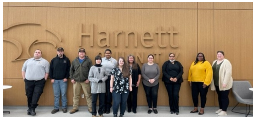
March 20, 2023 New Hire Orientation Class