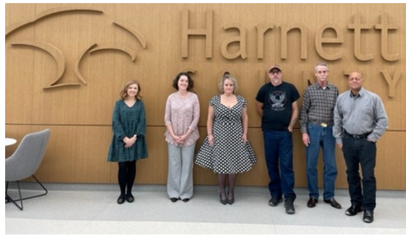
February 20, 2023 New Hire Orientation Class